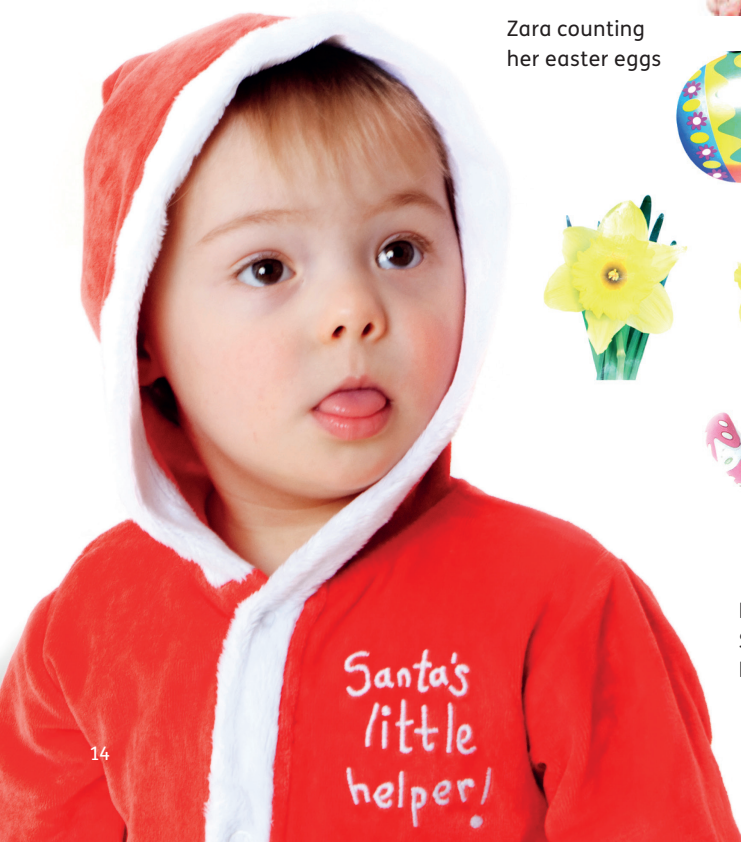
Zara counting her easter eggs